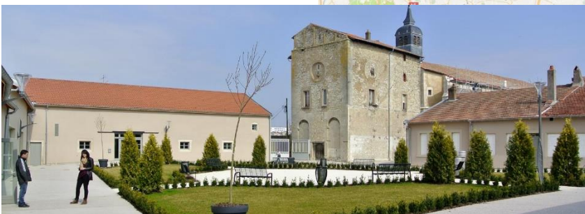
Espace Prieuré – Varangeville